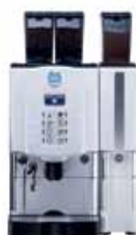
1 or 2 grinders Choco