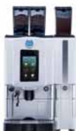
1 or 2 grinders Choco