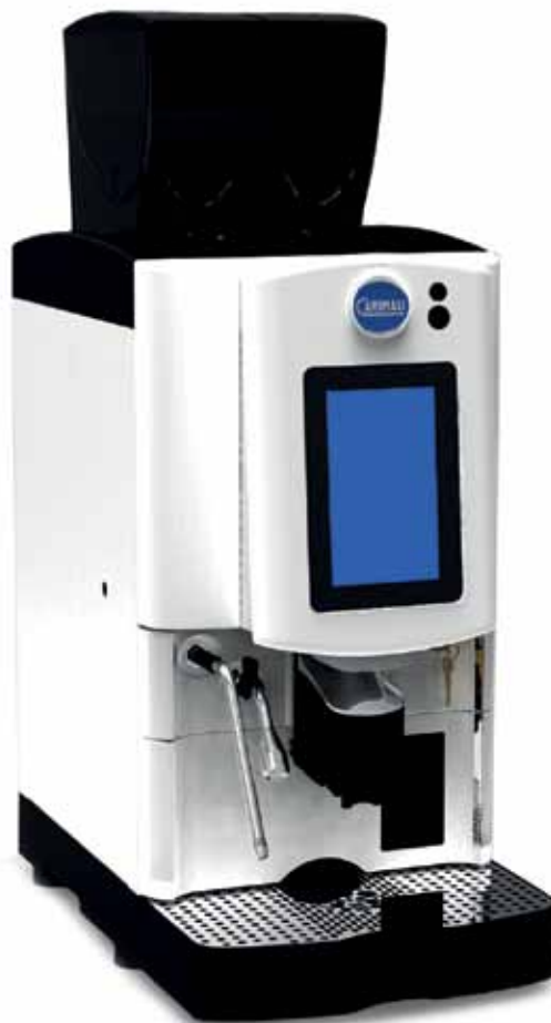
Optima Soft Plus